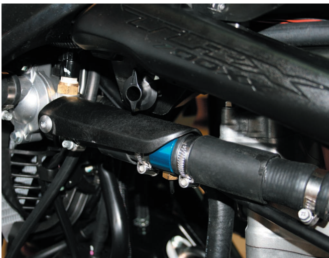
TRAIL TECH SPEEDOMETER TEMPERATURE SENSOR INSTALLED ON HONDA TRX700XX