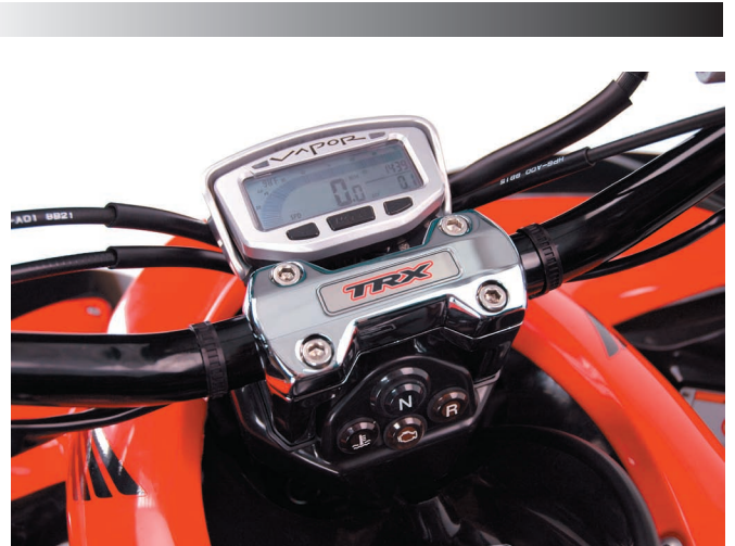
BAR CLAMP, X-BARS, AND VAPOR PROTECTOR INSTALLED ON HONDA TRX700XX