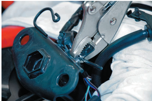
REMOVING WELDED WIRE TABS HONDA TRX700XX