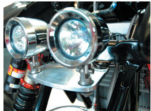
MOUNTING PLATE INSTALLED