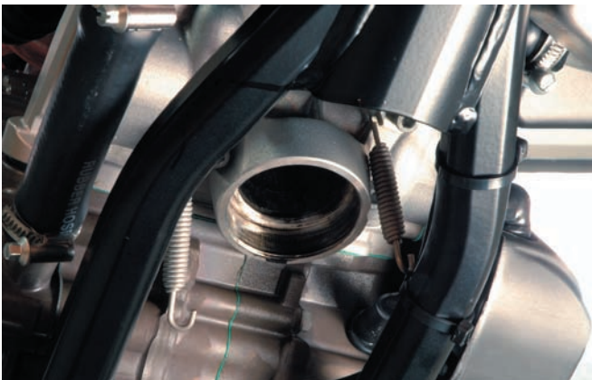
Exhaust system removed.